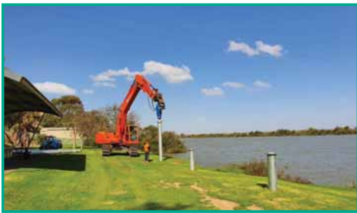
ABOVE: Installing moorings at Dickson Reserve.

Eight houseboat moorings were installed in early May, with final works to be completed ( three houseboat moorings will have concrete thrust blocks installed as the required depth could not be reached ).