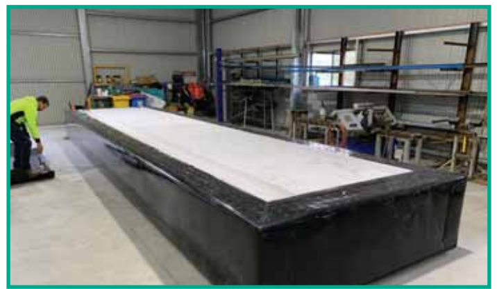
ABOVE: Dickson Reserve pontoon construction.